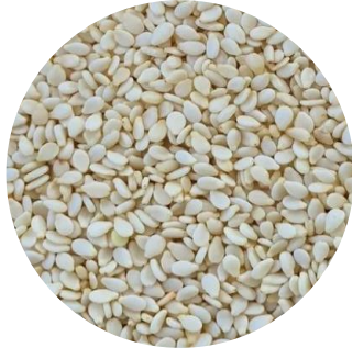
HULLED SESAME SEEDS سمسم أبيض مقشور