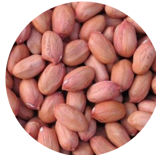
GROUNDNUT KERNELS الفاصوليا السوداني