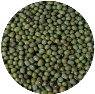
GREEN MUNG BEANS حبوب الماش الأخضر