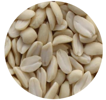
BLANCHED PEANUT الفاصوليا السوداني المقشور