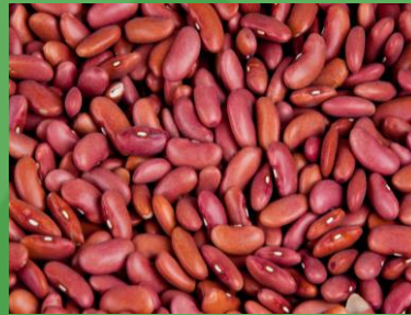
RED KINDEY BEANS