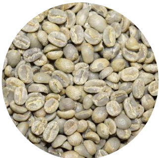
GREEN COFFEE BEANS القهوة الخضراء