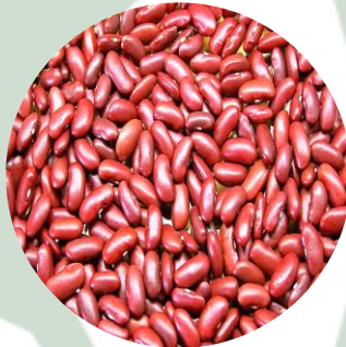
RED KIDNEY BEANS الفاصوليا الحمراء