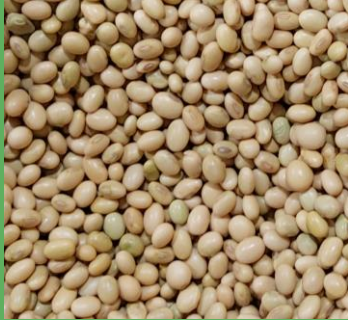
SOYBEANS NON-GMO TYPE /NEW CROP

PURITY 99% MIN, MOISTURE 8% MAX PROTINE 37% MIN, OIL CONTENT 18% MIN FULLY MACHINE CLEANED