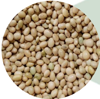
NON-GMO SOYBEANS فول الصويا