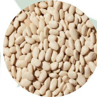
WHITE BEANS الفاصوليا البيضاء