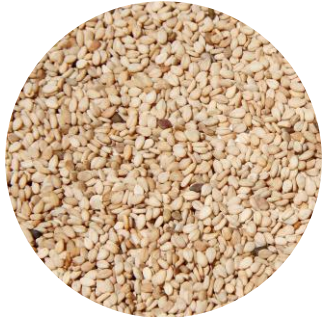
WHITISH SESAME SEEDS سمسم أبيض درجة أولي