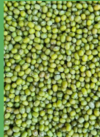
GREEN MUNG BEANS TYPE /NEW CROP

FULLY MACHINE CLEANED WITH ADMXTURE 2 PERCENT MAX, FREE FROM DEAD AND ALIVE INSECTS, FUGMIGATED PRIOR TO SHIPMENT FIT FOR HUMAN CONSUMPTION