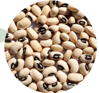
BLACK EYE BEANS