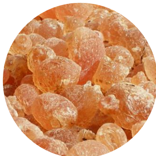
GUM ARABIC الصمغ العربي