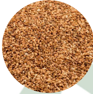
REDDISH SESAME SEEDS سمسم أحمر